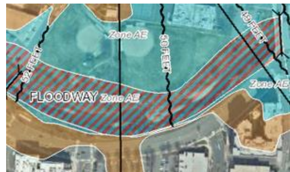
Figure 3: Sample Results

Since topographic data is a snapshot in time, local communities and counties have also been providing updated information for areas where there are multiple concurrent construction and/or recovery efforts happening. If it is possible within the project timeline, updated information is incorporated into the CHAMP modeling; if they are not captured, additional changes still can be made to these studies after CHAMP is finalized through FEMA's Letter of Map Change (LOMC) process.