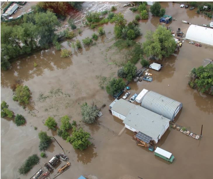
Poudre River flooding along Vine Drive in September 2013